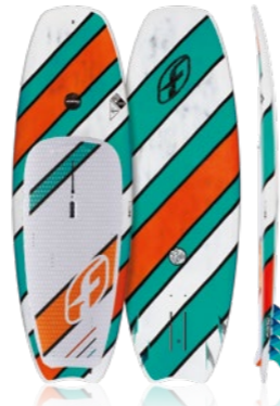
PAPENOO PRO CONVERTIBLE